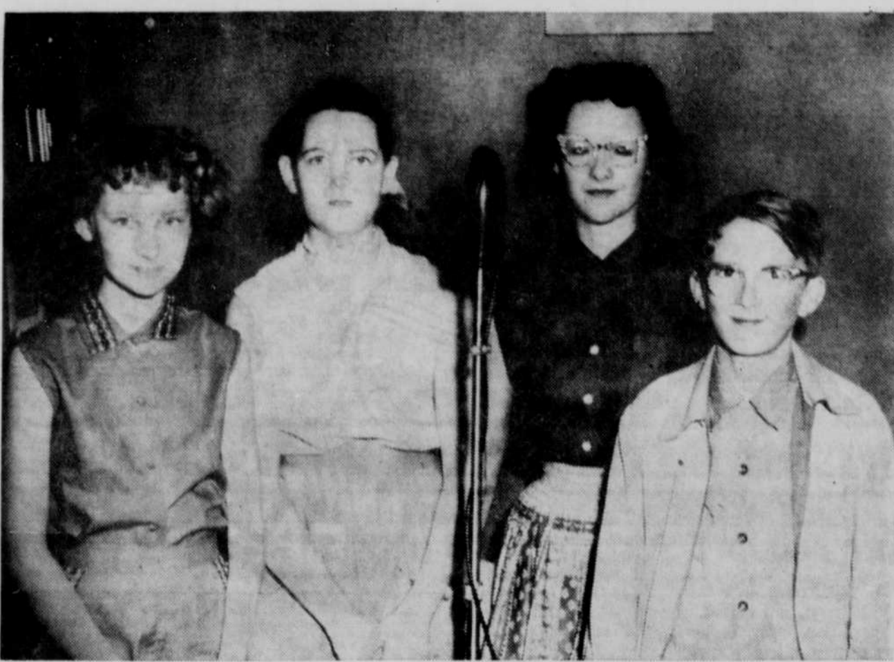
District 163 Pupils Visit