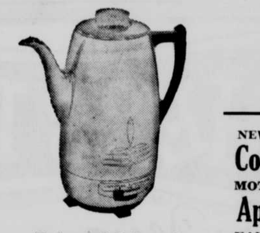
Universal Coffeemaker Coffee Maker Free for 7 1/2 Books