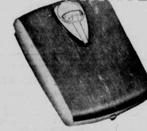
Borg Bath Scale Free for 2 Books

You'll save on price...you'll save twice with Top Value Stamps