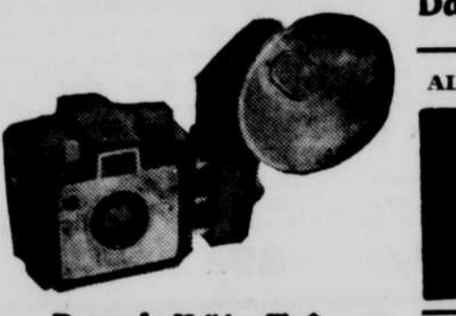
Brownie Holiday Flash Camera Outfit Free for 2 1/2 Books