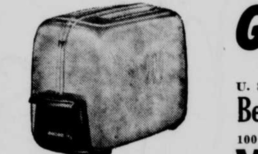
Toastmaster Toaster Free for 4 1/2 Books