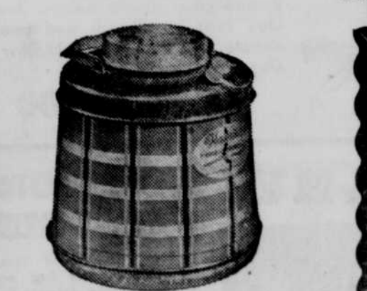
Polaron Picnic Spout Jug Free for 1 Book

MEADOW GOLD—HOLLAND DUTCH ICE CR'IM 1/2 GAL. 49c CHASE AND SANDBORN COFFEE PER LB. 89c TABLE READY OLEO 4 LBS. 79c