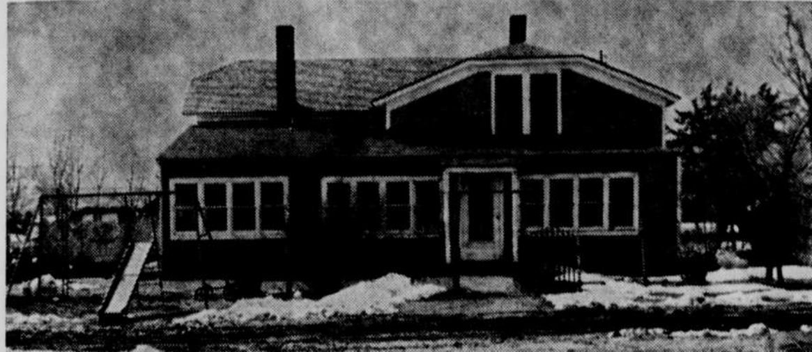
LOOKING WEST AT THE EIGHT-ROOM HOUSE