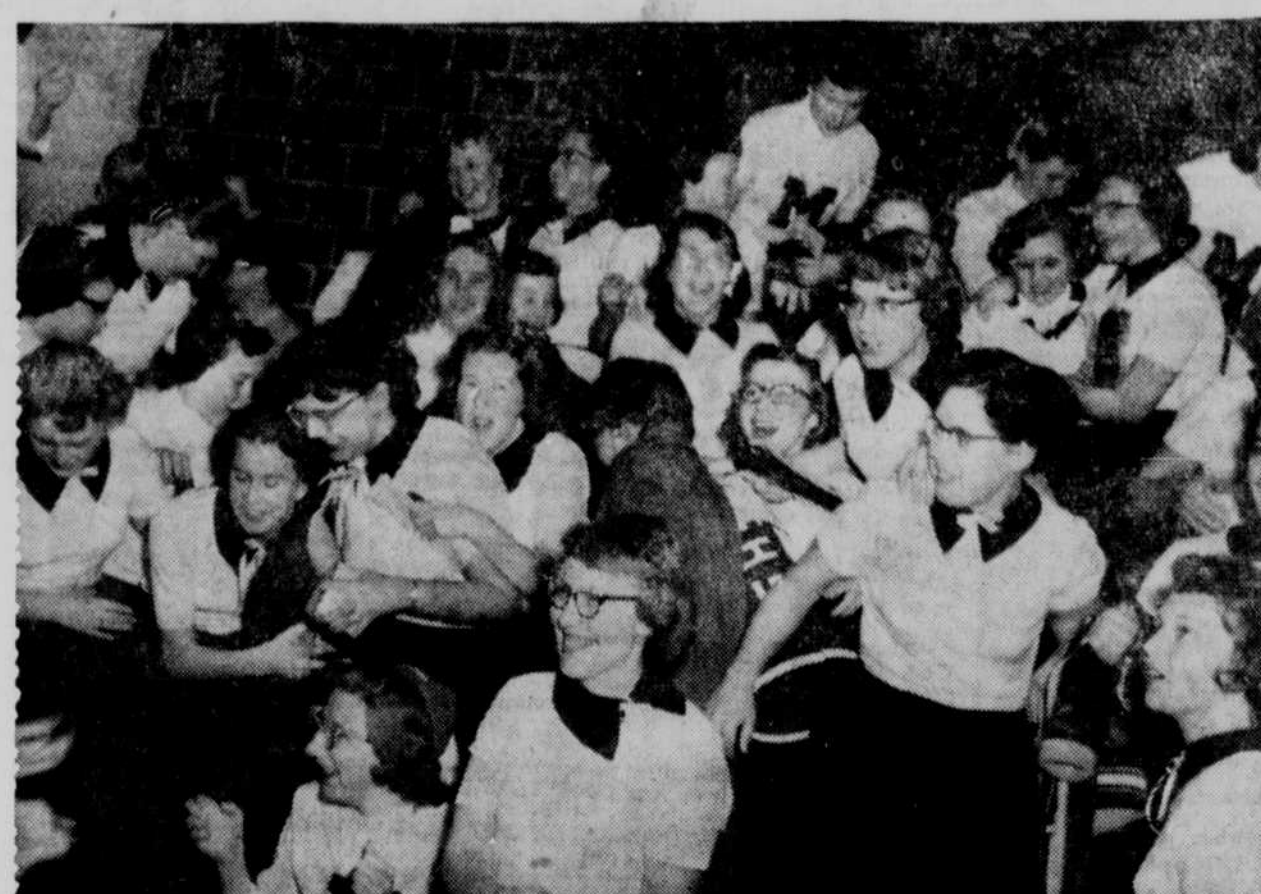
Happiness reigned in the Stuart cheering section Tuesday night following the Broncos' 48-45 win over the Page Eagles, enabling Stuart to reach the Holt tourney finals.