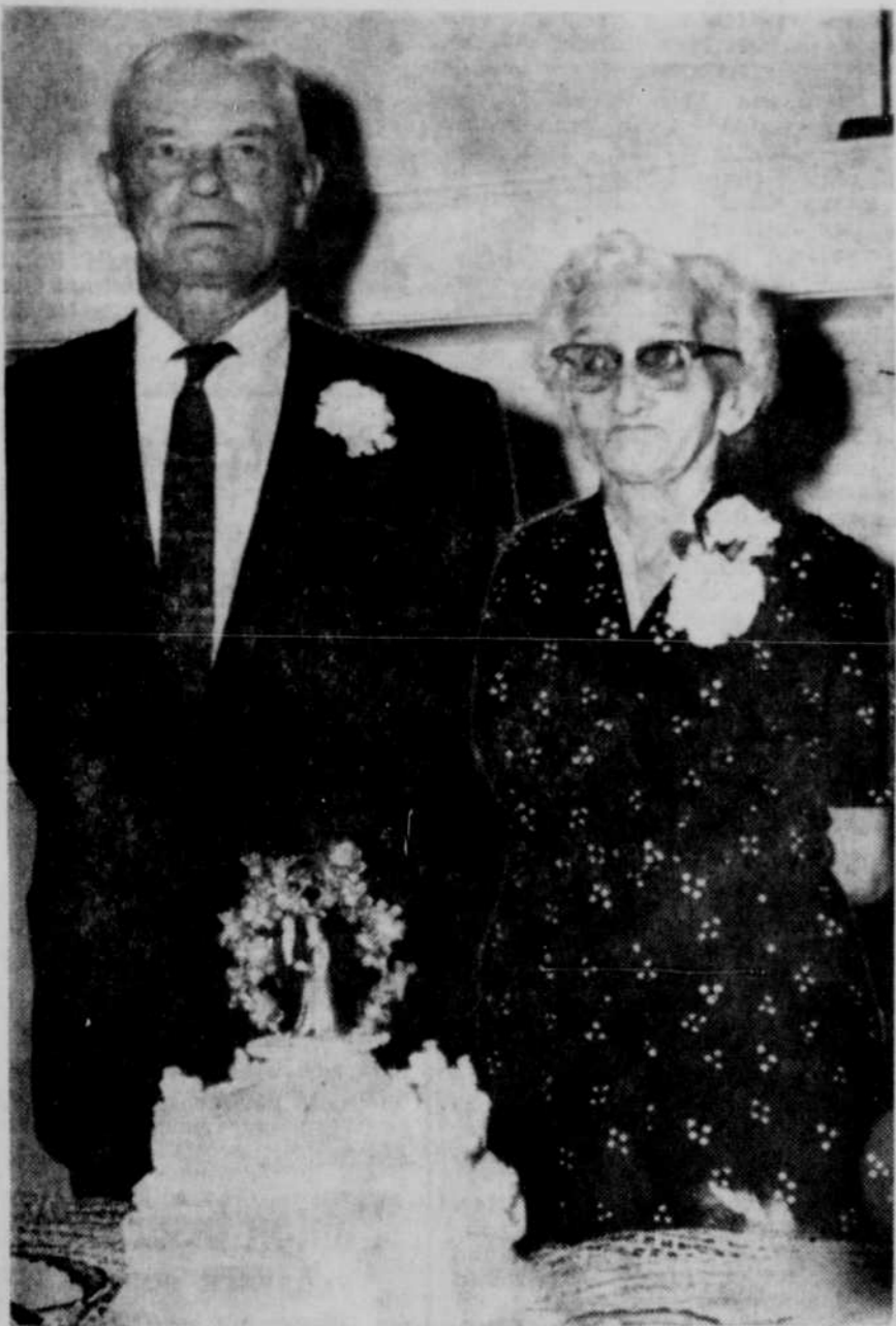
The Clydes . . . both enjoy good health.