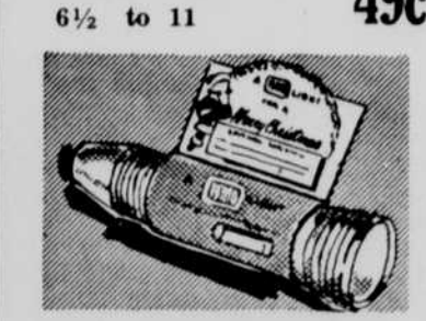
Polished chrome 2-cell Flashlight Gift card.