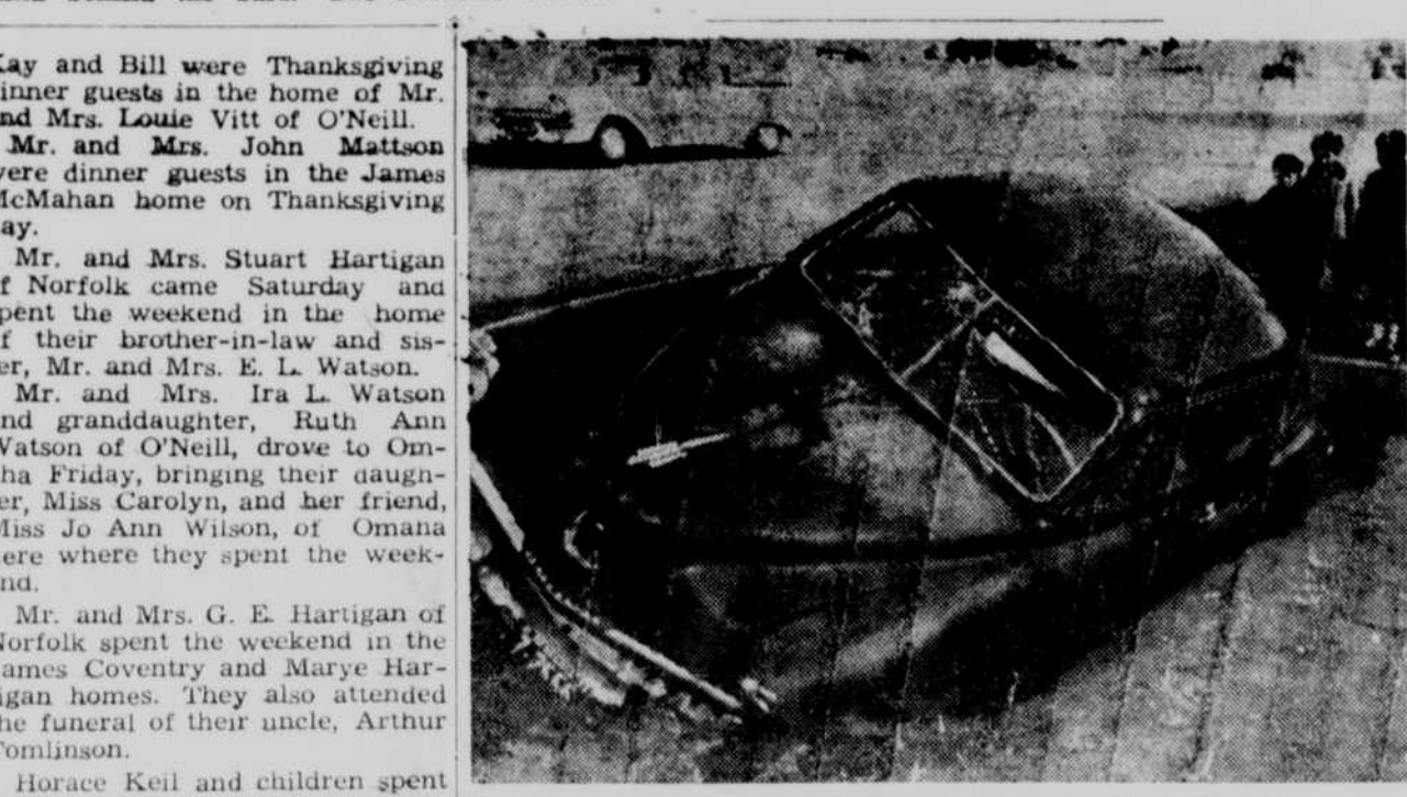
This car was wrecked Sunday noon on West Douglas street when the escapees from a South Dakota training school attempted to elude enforcement officers.