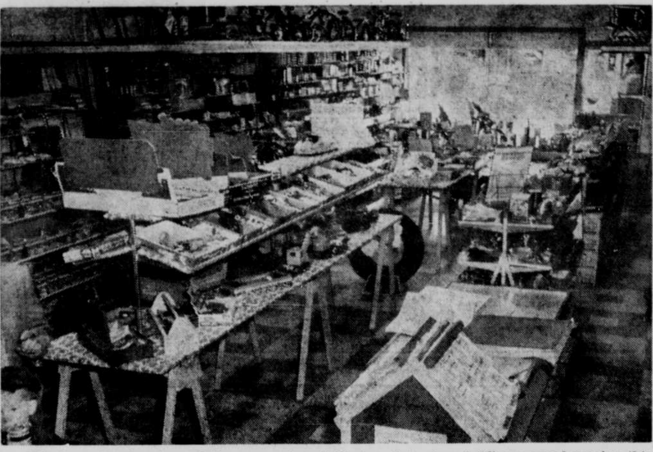
This is an interior view of the new, enlarged Western Auto store, holding a grand opening this weekend. The store is now in the Consumers building.