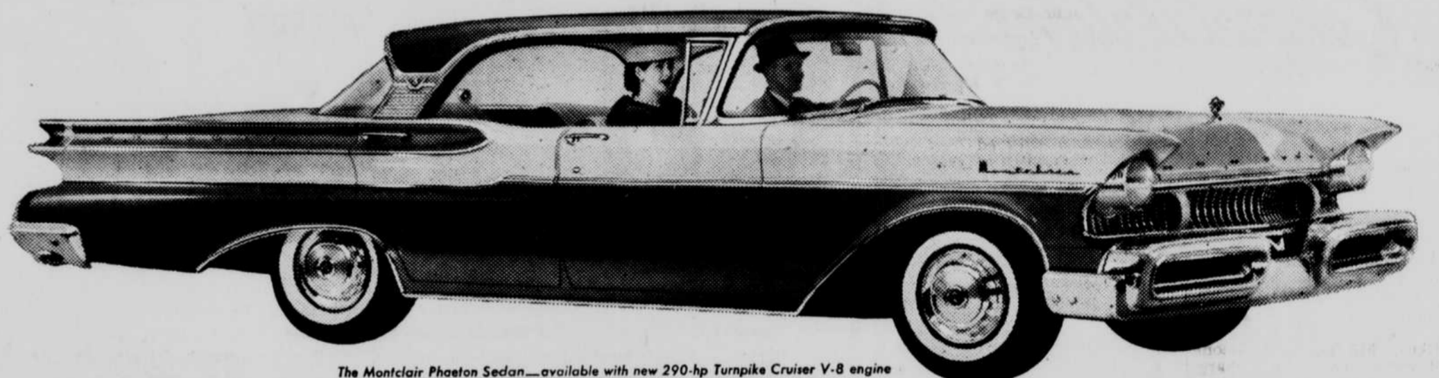
The Montclair Phaeton Sedan—available with new 290-hp Turnpike Cruiser V-8 engine

MIDWEST FURNITURE & APPLIANCE COMPANY West O'Neill