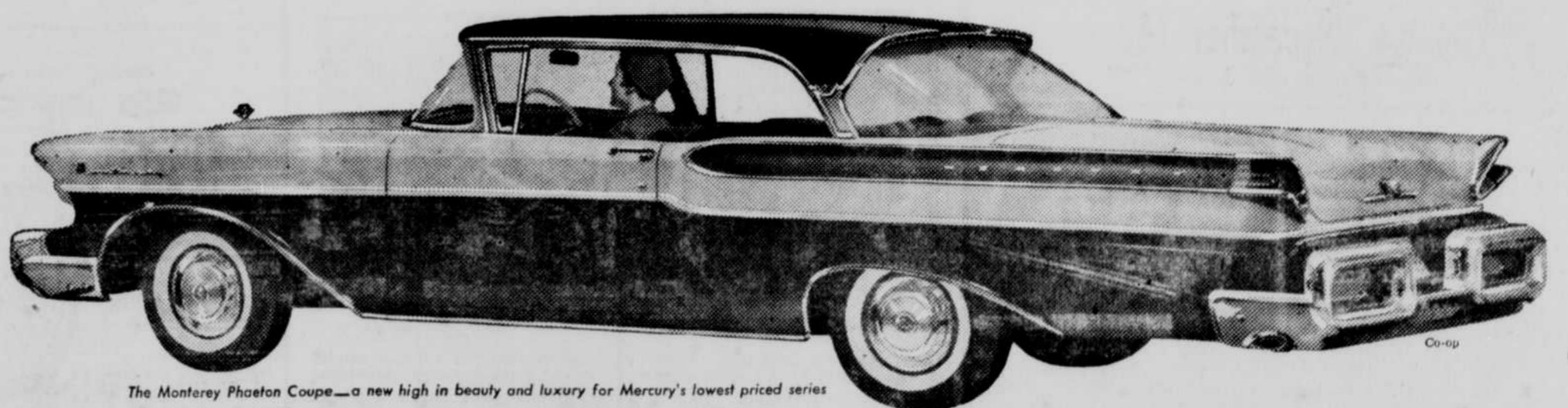
The Monterey Phaeton Coupe—a new high in beauty and luxury for Mercury's lowest priced series

Everything that counts in a car has been changed dramatically! Mercury for '57 presents: Dream-Car Design · Biggest size increase in the industry · Exclusive Floating Ride · New Keyboard Automatic Transmission Control · New 255 and 290 hp V-8 engines · Exclusive Power-Booster Fan · Dream-Car features everywhere you look. Stop in—see how The Big M outdates them all.