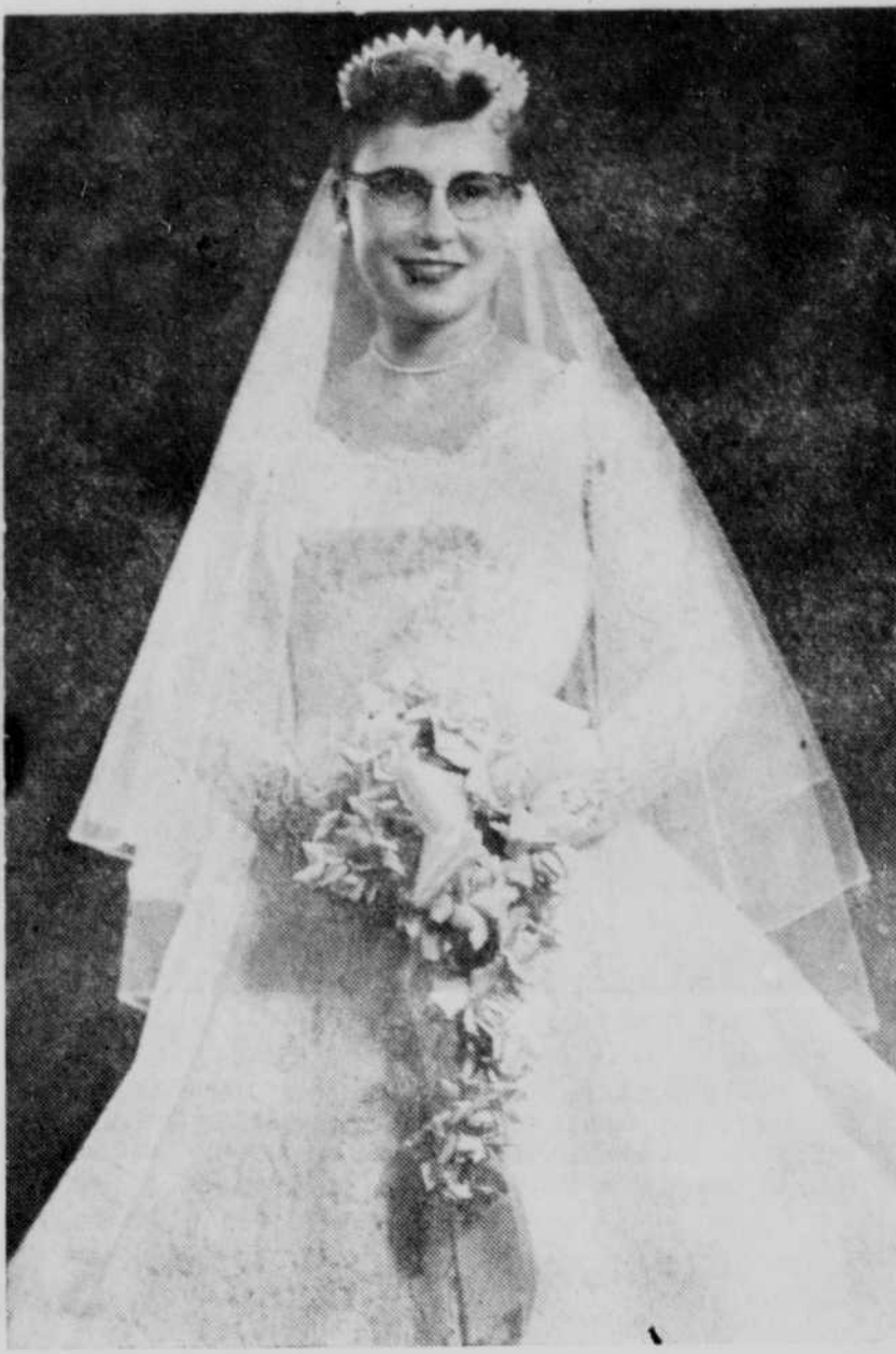
Weds in Lynch Church