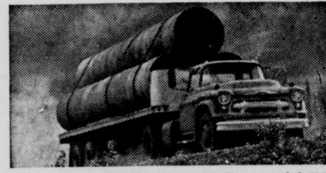
All the way in DRIVE range with Powermatic! This Powermatic-equipped 10000 Series tractor traveled the Alcan Highway in a single forward-speed range!

Only franchised Chevrolet dealers CHEVROLET display this famous trademark