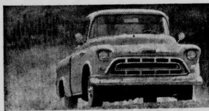
Alcan fleet reports up to 18.17 miles per gallon! That's the mileage reported by the Cameo Carrier, with Thriftmaster 6 and Overdrive (optional at extra cost).

Heavyweight Champs with Triple-Torque tandem are rated at 32,000 lbs. GVW, 50,000 lbs. GCW. Special features include built-in 3-speed power divider.