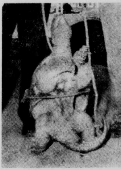
Mr. Turtle.. from the underside.