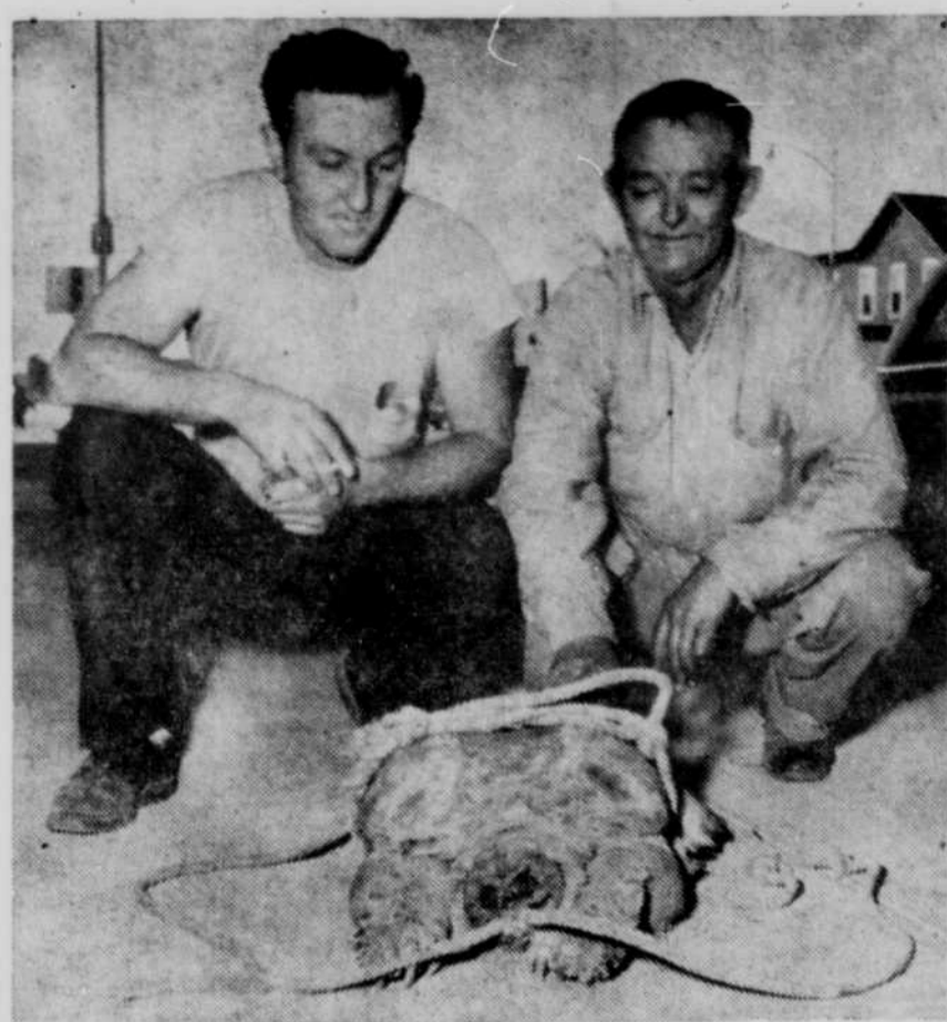
47-Pound Turtle Headed for Stew