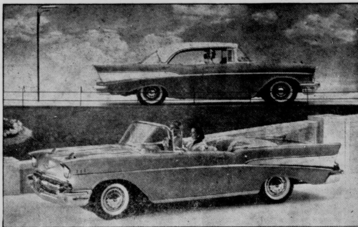
The 1957 Chevrolet to be unveiled here Friday.