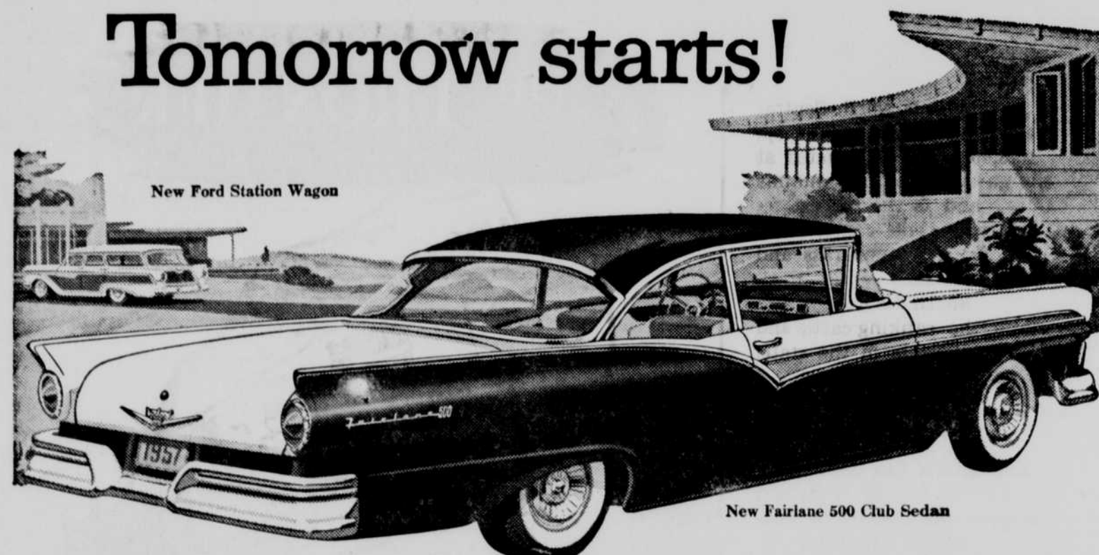
New Ford Station Wagon