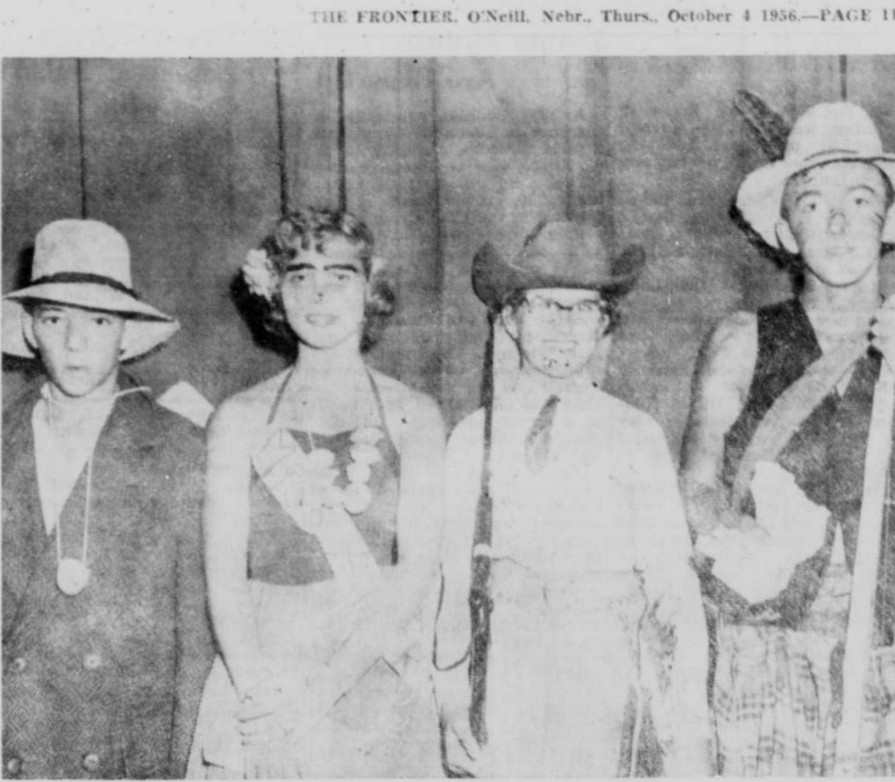
Motley Crew Gets Frosh Treatment

Stuart is idle next week in preparation for its annual homecoming battle with Atkinson.