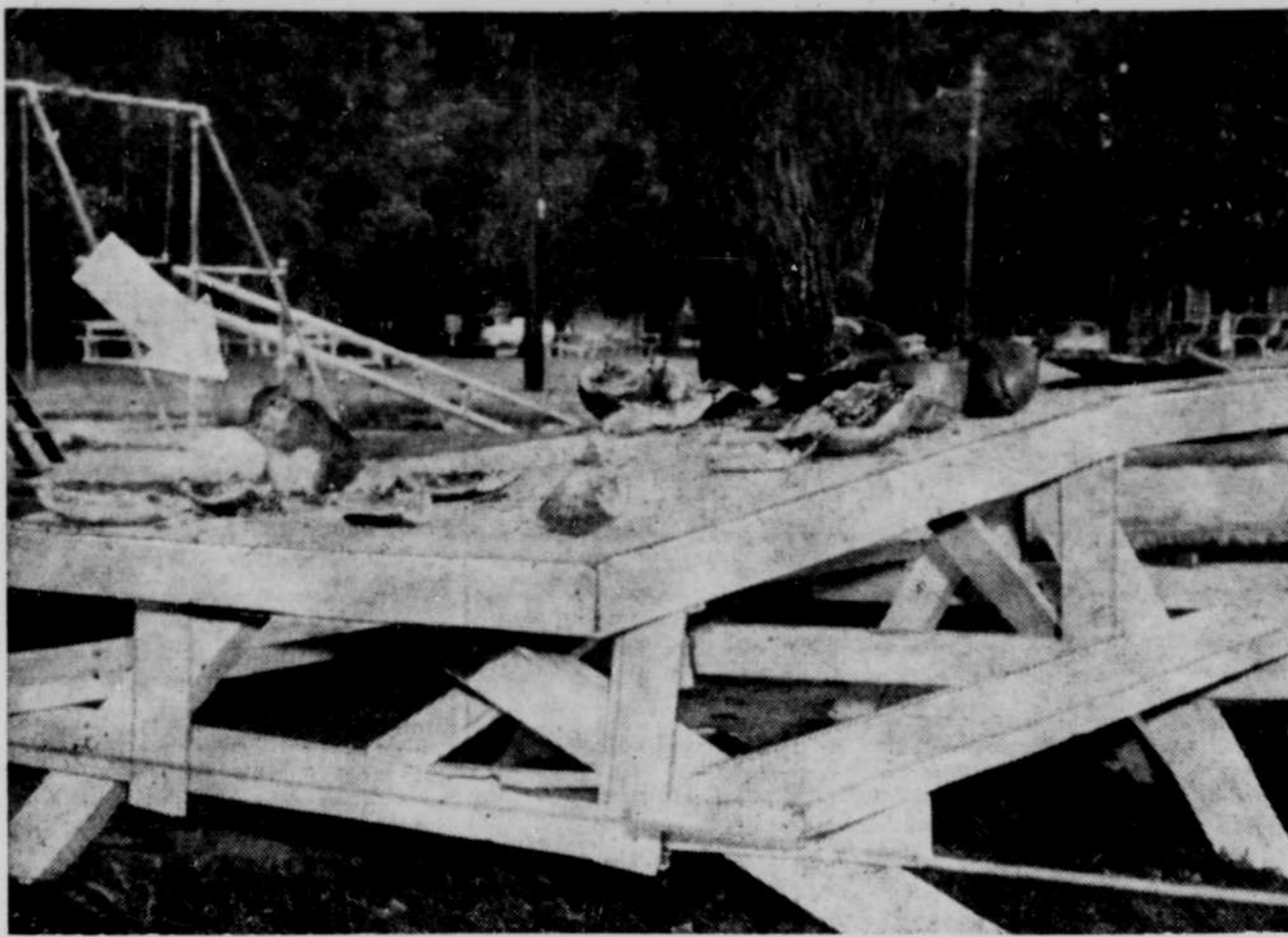
Squirrel Doesn't Mind Wreckage or Melon Remains