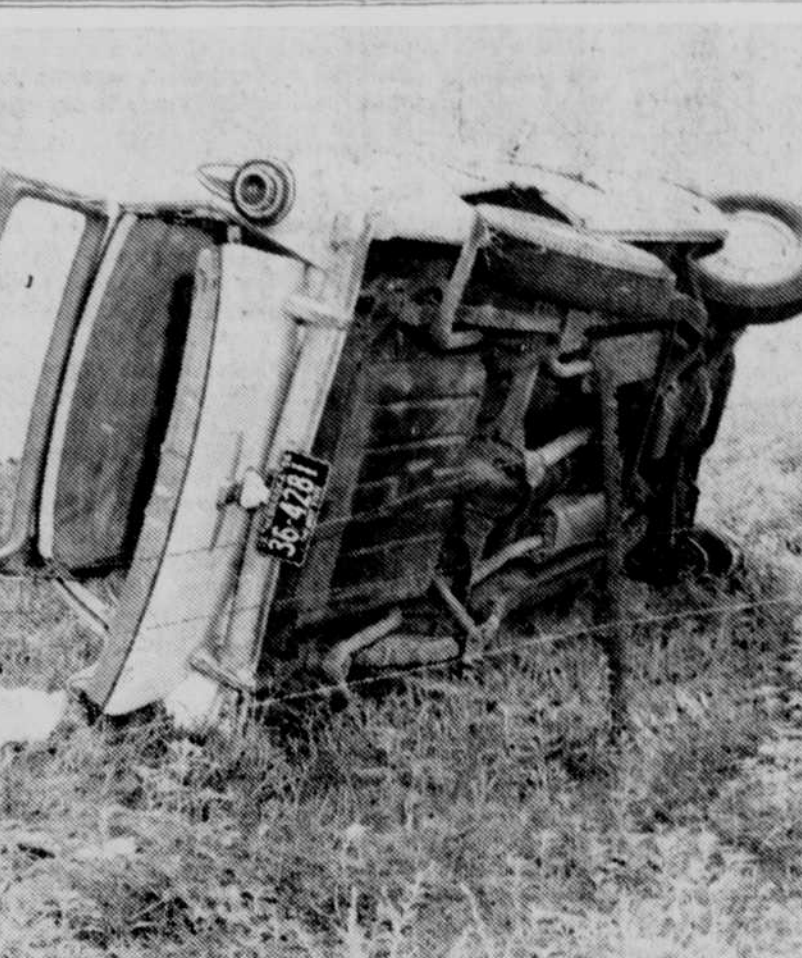
This wreckage (above) Wednesday sent three tourists from Arlington, Va., to the hospital.