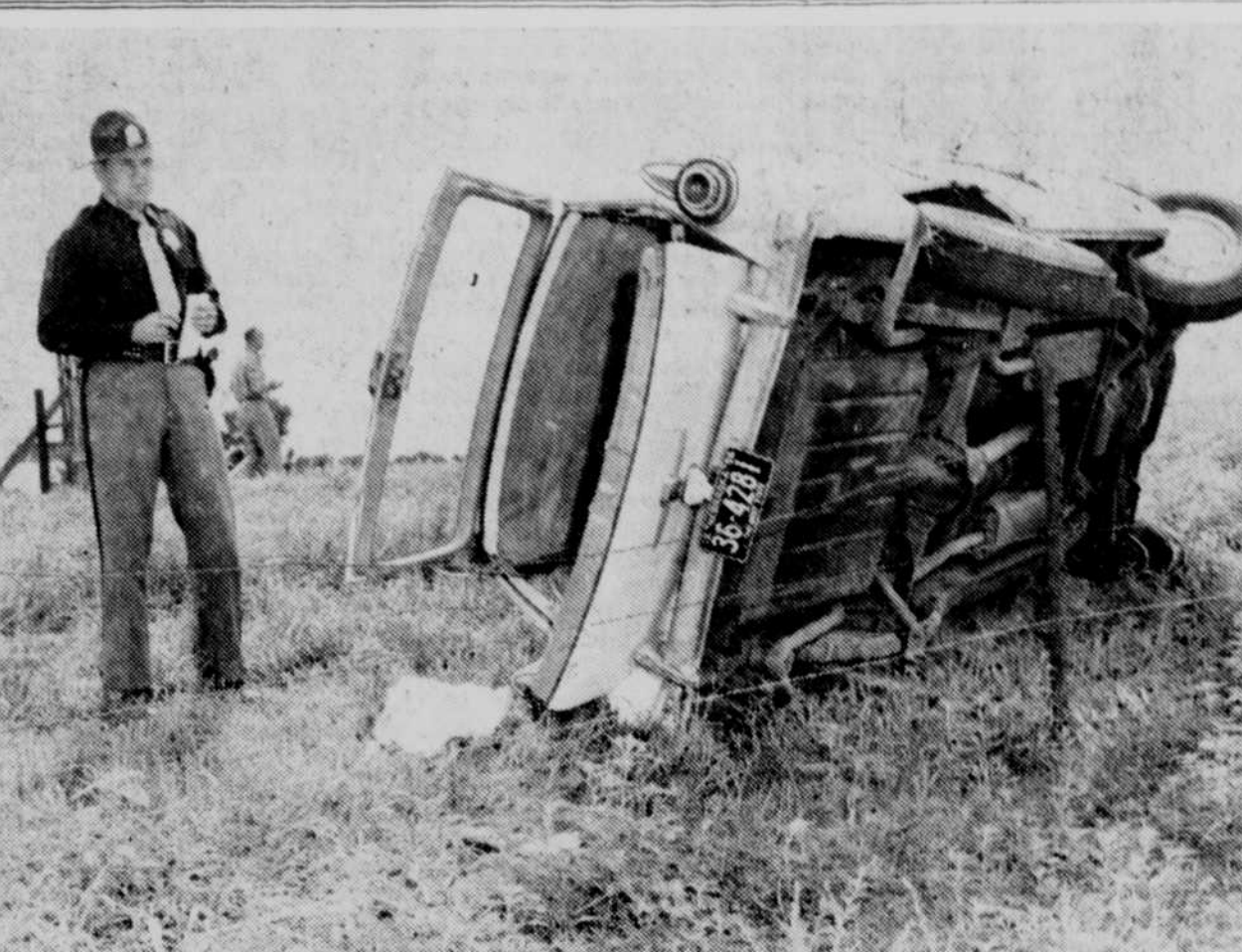
Overturned Artus station wagon . . . three adults and seven children escaped serious injury. State Trooper Carl Scheel investigated.

EWING—Lightning struck the large stock barn on the Harry Van Horn ranch near Ewing early Saturday morning during a thunder shower.