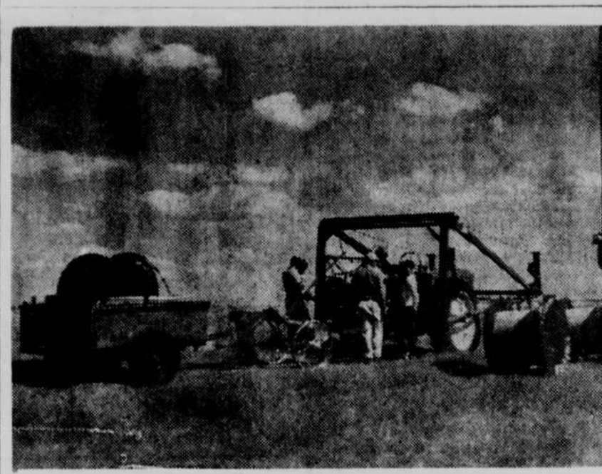
Improvised machine constructed by two O'Neill firms lays electric cable for wind testers