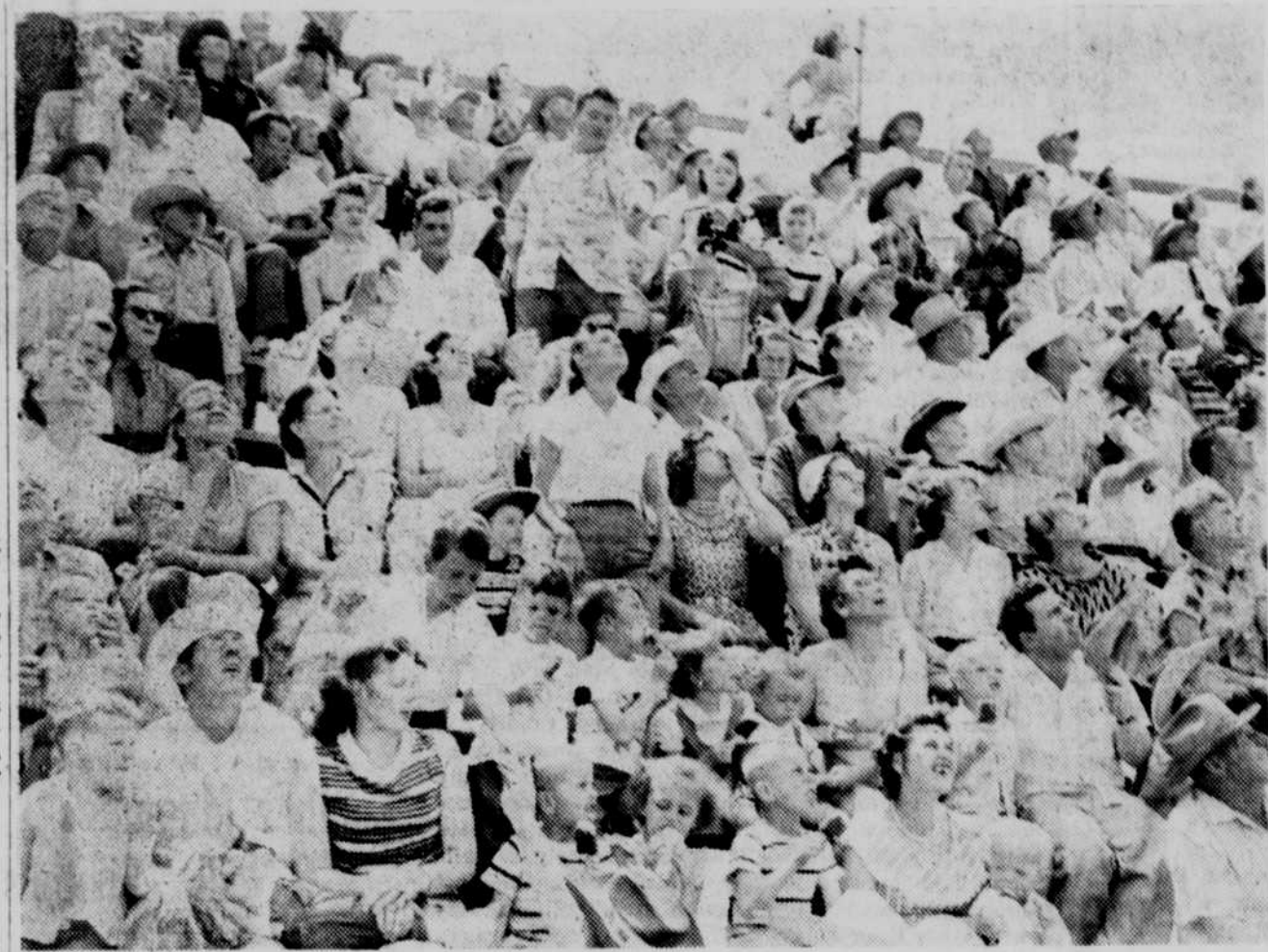
Thar They Go — Those Jets! All necks craned skyward Sunday afternoon at Municipal airport as five air national guard jets streaked overhead in formation. This interesting photo reveals mixed reactions.