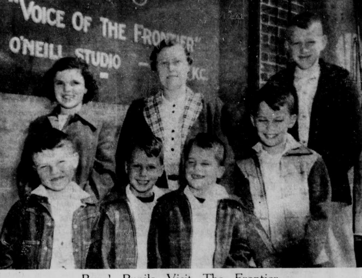
Rural Pupils Visit The Frontier

ed. 5½' solid glass rod, reel, line, plug,