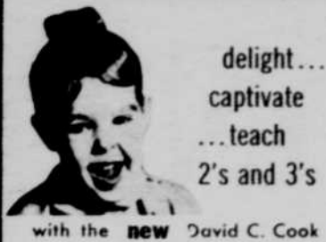
with the NEW David C. Cook