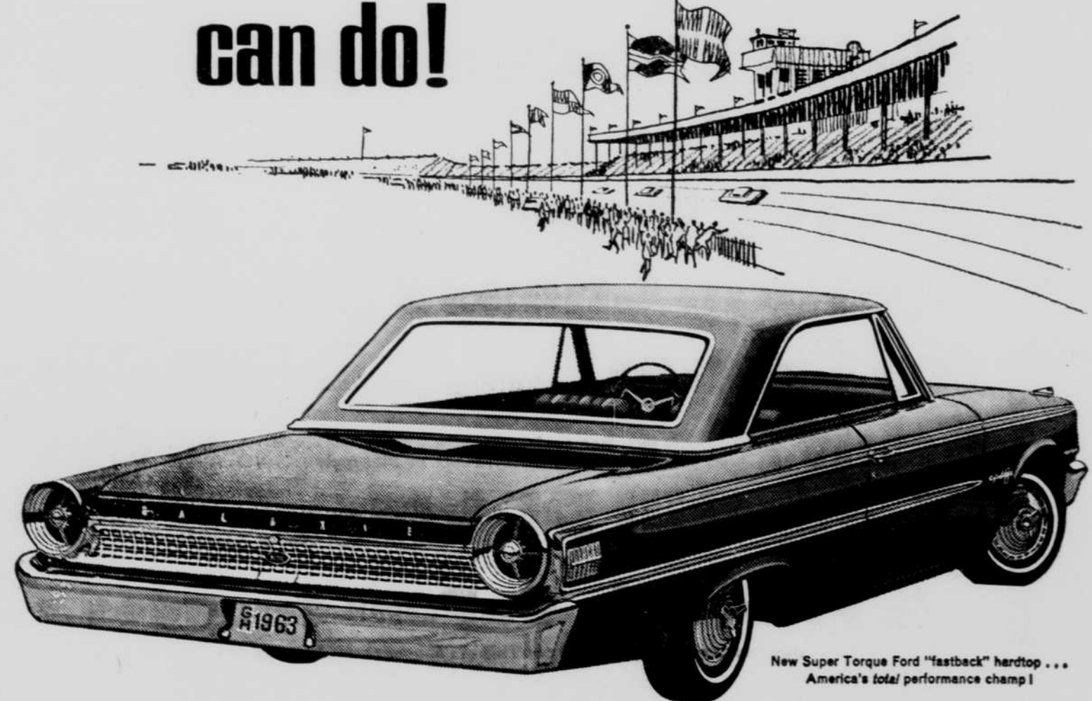
New Super Torque Ford "fastback" hardtop... America's total performance champ!

Come in...road-test this total performance Ford yourself!