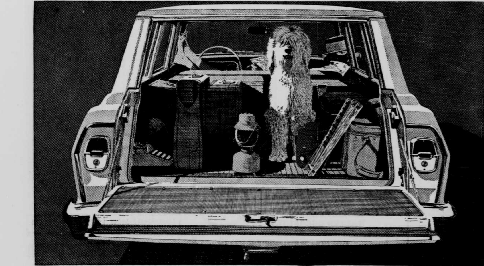
Chevy II Nova 400 6-Passenger Station Wagon

A Chevy II wagon looks this big when you load it up