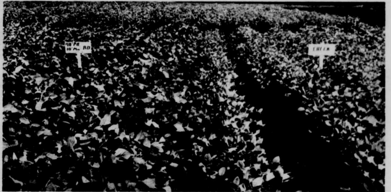
Manganese made this difference in soybeans.