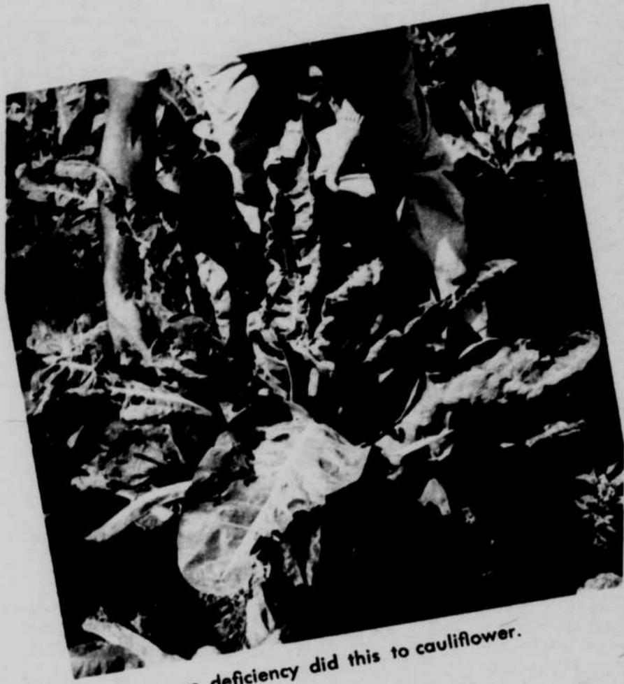
Molybdenum deficiency did this to cauliflower.