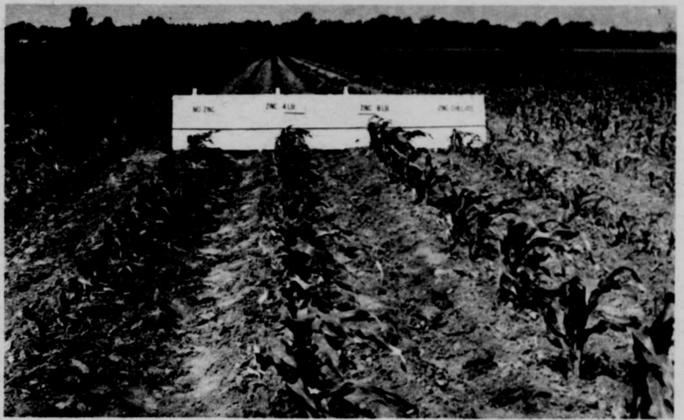
Zinc made this difference in corn.