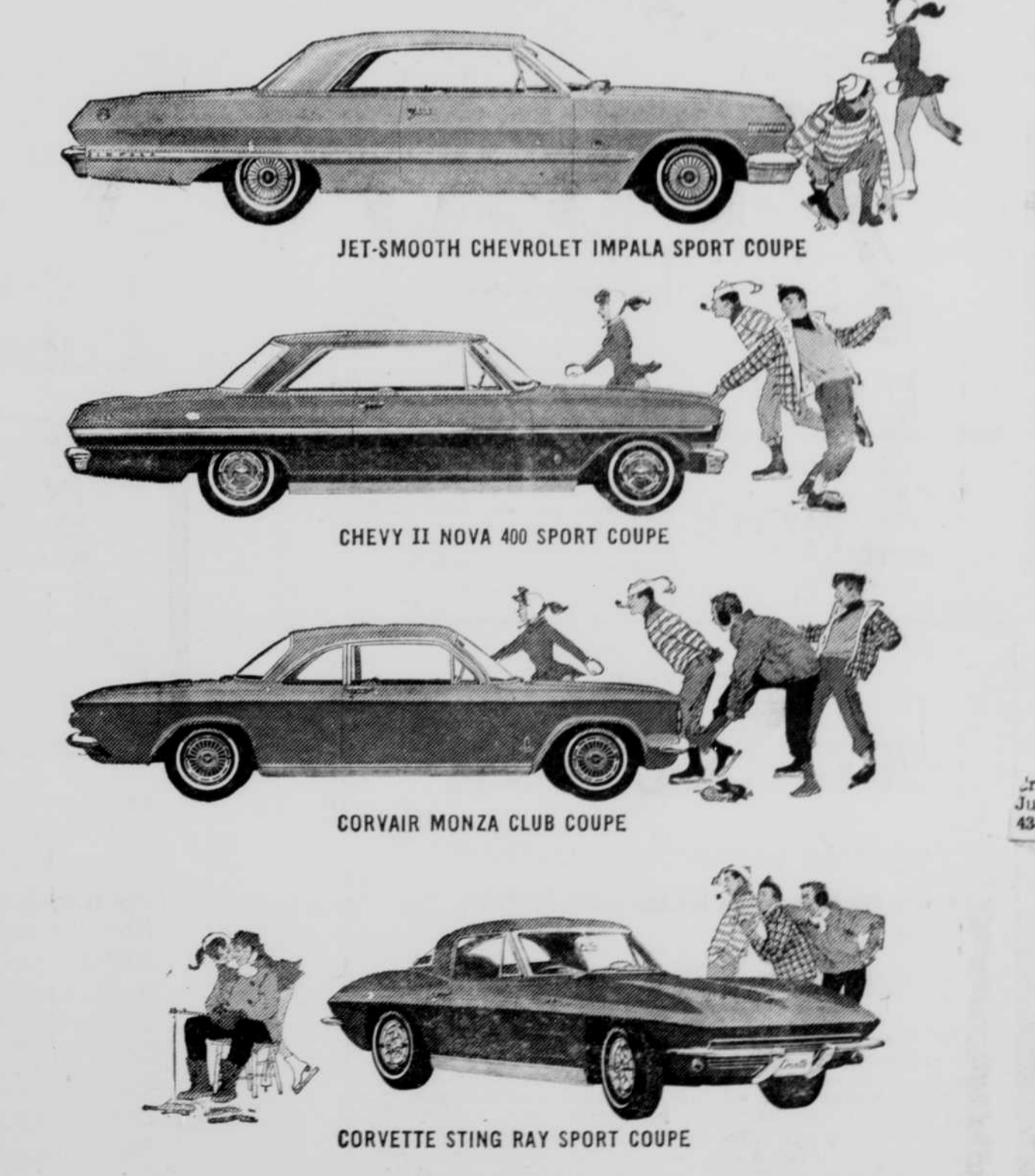
Now--Bonanza Buys on four entirely different kinds of cars at your Chevrolet dealer's

You can see why one of America's favorite outdoor sports is driving Chevrolets, with four entirely different kinds of cars to choose from. There's the Jet-smooth Chevrolet, about as luxurious as you can go without going overboard in price; the low-cost Chevy II, a good-looking car that would send any family packing; another family favorite, the sporty Corvair, whose rear-engine traction will make you think that ice and snow are kid stuff; and for pure adventure, America's only sports car, Corvette--now in two all-new versions with looks that can stop traffic like a rush-hour blizzard. Picked your favorite already? The next thing is to take the wheel at your Chevrolet dealer's. If that doesn't have you thinking of places to go, maybe you'd rather just have a ball around town!