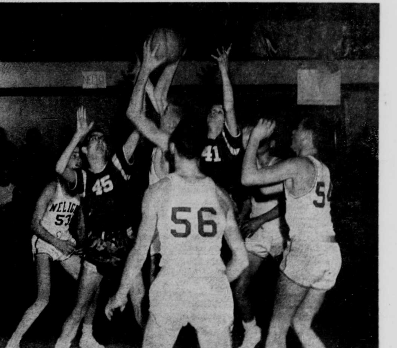
O'NEILL'S JUNIOR HIGH CAGERS TUESDAY night suffered their first defeat of the season as Neligh dropped them, 48 to 21, in the junior high tournament. The little Eagles, however, will return to Neligh tonight to meet Orchard in the consolation game while Neligh takes on Plainview for the championship.