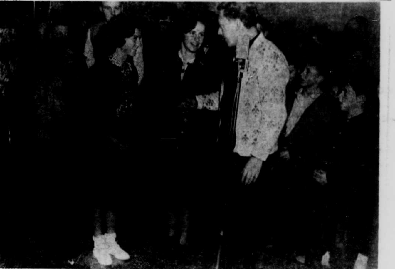
TWO ST. JOSEPH'S PEP CLUB GIRLS are shown here receiving the good sportsmanship trophy presented by KBRX to the St. Joe's cheering section for their well-mannered and enthusiastic behavior at the tournament.