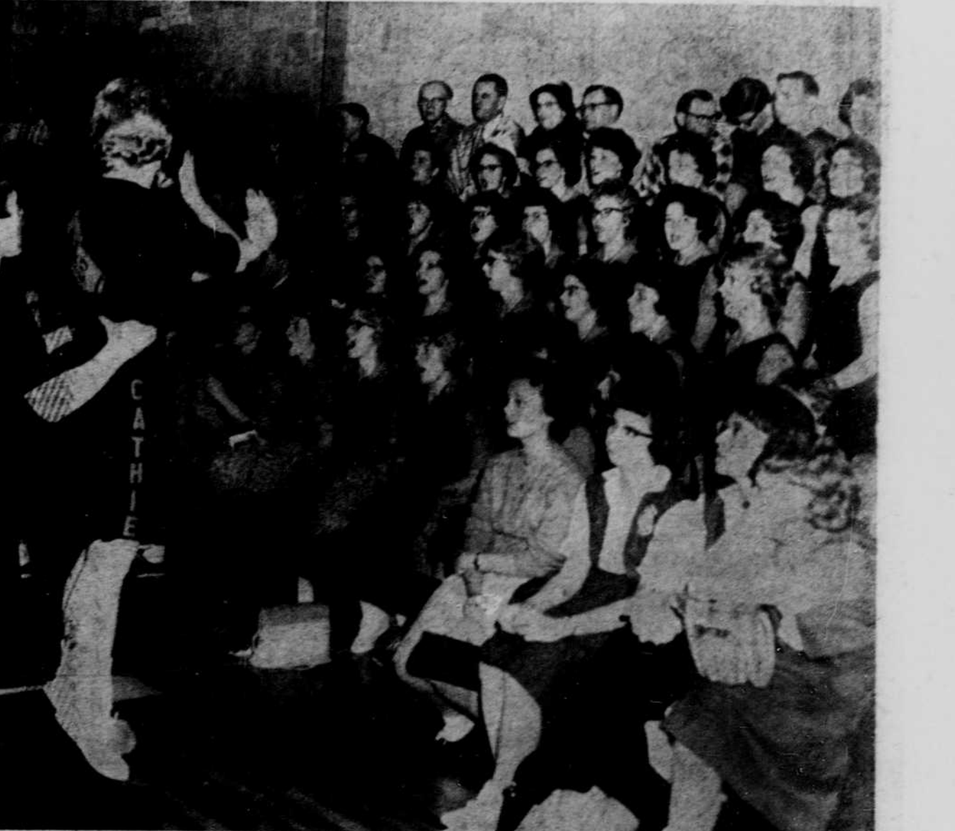
ATKINSON HIGH'S CHEERING SECTION goes through their paces at the tournament Friday night as the Balers battled the Stuart Bronchos.