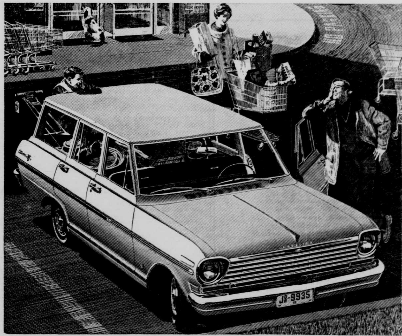
Nova 400 4-Door 6-Passenger Station Wagon

this one goes and goes on a gallon. They grow with brakes that adjust themselves. An exhaust system that lasts longer. And a Deleotron generator that keeps battery reserve power up. Want to hear more? How about a low price, natty interiors, Body by Fisher craftsmanship—and a talk with your Chevrolet dealer soon!