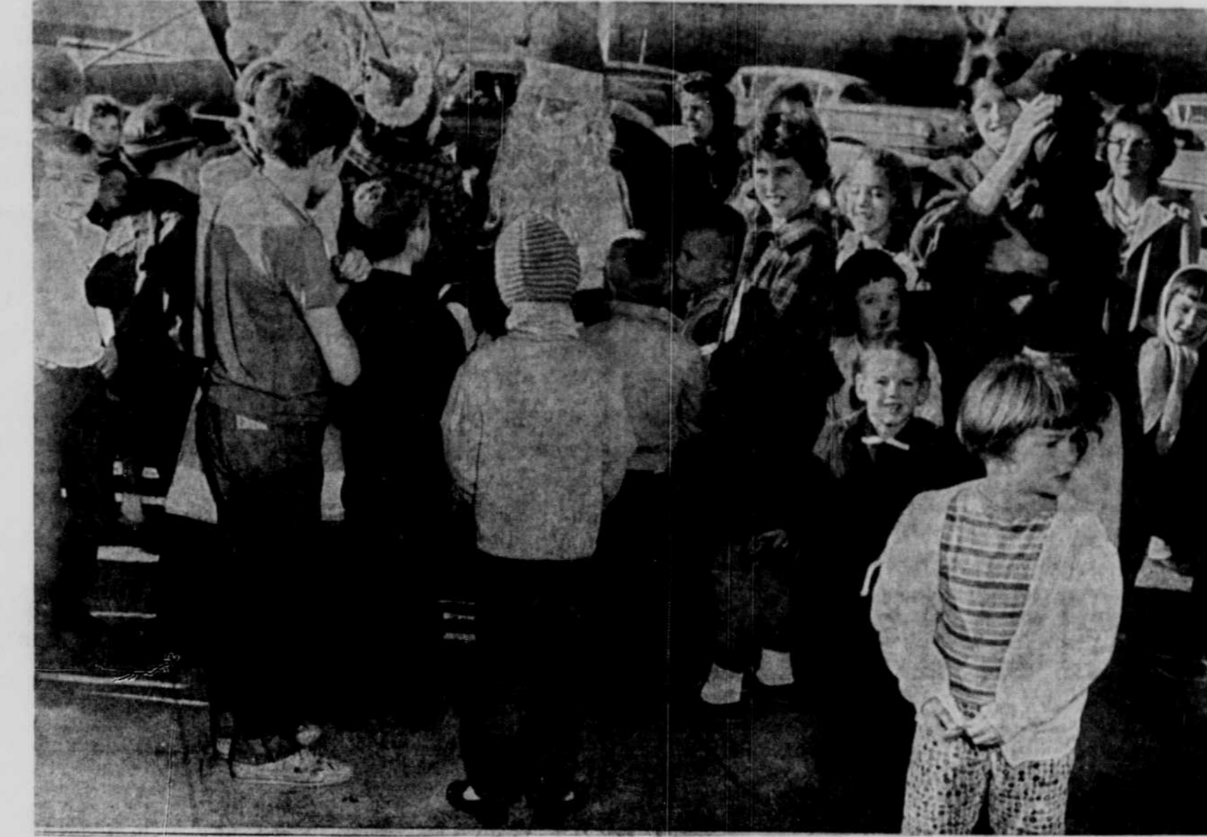
KIDS, KIDS AND MORE KIDS — Santa Claus found himself deluged by children when he made his annual trip to O'Neill Saturday. As the old gent talked to the young fry on the school house playground, Chamber of Commerce helpers handed out over 1500 sacks of goodies to the children.