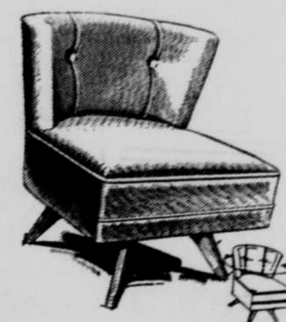
Swivel Occasional Chair 27 88