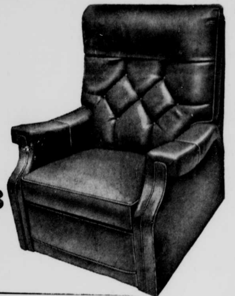
BERKLINE DELUXE RECLINER