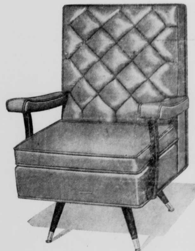
Berkline Swivel Rocker 49 88