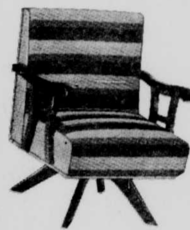
Berkline Rocker 27 88