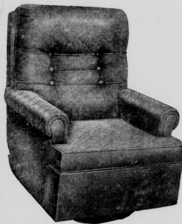
Berkline Large Swivel Rocker 67 88