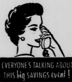
EVERYONE'S TALKING ABOUT THIS BIG SAVINGS EVENT!