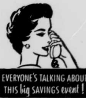
EVERYONE'S TALKING ABOUT THIS BIG SAVINGS EVENT!