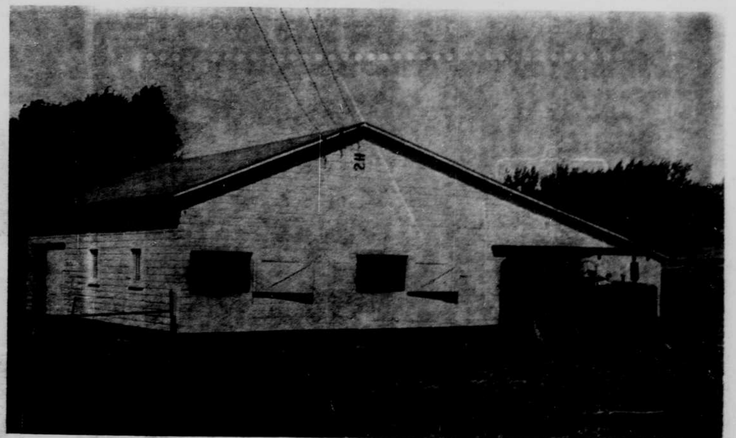
NEW BARN . . .

GENERAL: This is a well balanced stock and grain farm, with good improvements and comfortable home, located 1 \frac{1}{2} miles from new consolidated school and country store. This farm has a record of continuous production and will make a profitable operation for the right man.