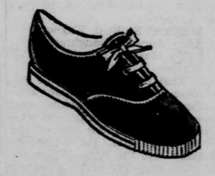
Children's Oxfords Sizes 5-12