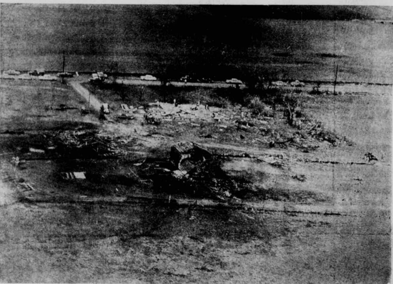
THE JOHN PETERSON FAMILY was injured when their farmhouse was demolished by the twist-er. The Petersons, their daughter and her two children were caught in the house when the storm struck. A storm cellar is located a short distance from the house but the Petersons were unable to reach it before the tornado struck.

family escaped harm when they sought refuge in the basement of the house.