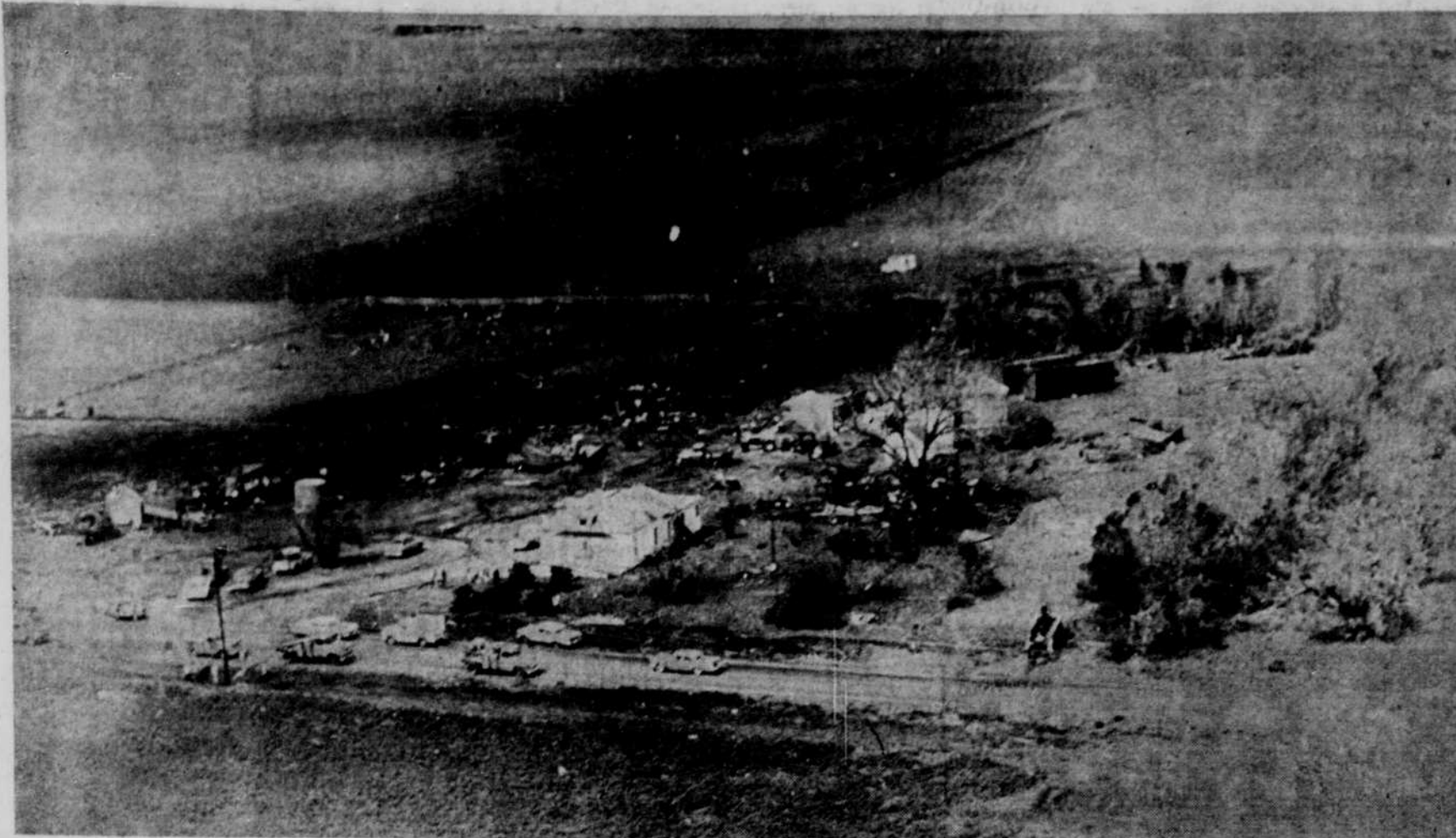
A dozen farms in the Naper and Bonesteel area were damaged severely by a tornado which swept through the area. The Paul Honke farm, shown above, suffered damage to nearly all the buildings. The

family escaped harm when they sought refuge in the basement of the house.