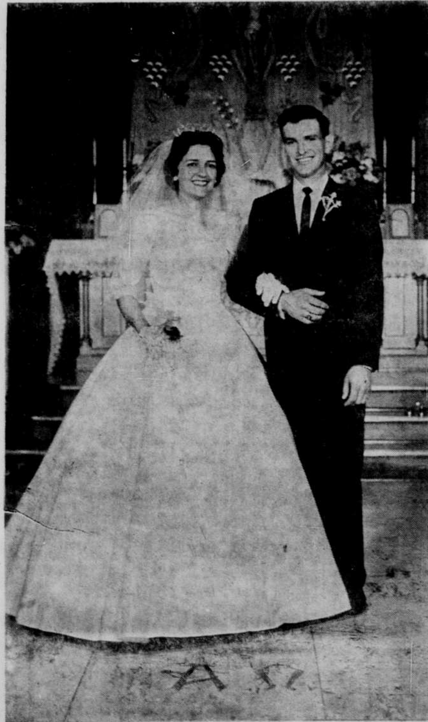
Couple Wed In Catholic Rite At Ewing Church