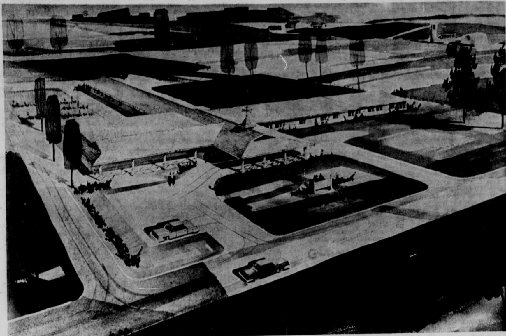
THE NEW HOME FOR SENIOR CITIZENS to be built this year in O'Neill.