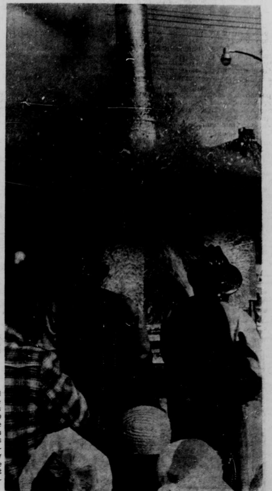
O'NEILL'S FENIAN FIASCO ST. PATRICK'S DAY ended as expected . . . and the effort to orbit an Irishman in the homemade rocket failed. O'Neill firemen rescued the anxious astronaut from the smoking launching pad with lime-green foam. Shown above is a fireman dousing the pad with the foam while the silvery shaft of the rocket towers through the smoke.