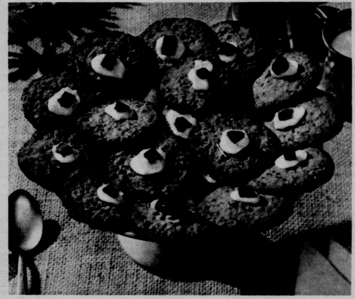
Grace Manney's cookie jar features Down East Fruit Cookies, a favorite with children. Molasses, cinnamon, nuts, raisins and glace fruit make them rich.