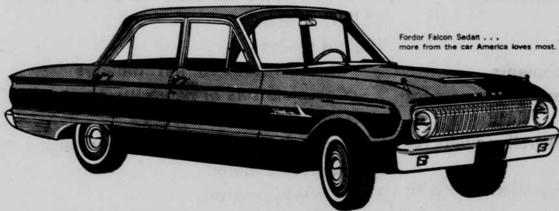
Ford Falcon Sedan... more from the car America loves most.

FALCON IS OUTSELLING THE OLD "COMPROMISE" COMPACTS WITH THE FAT PRICE TAGS! FALCON IS OUTSELLING THE NEW "NUMBER II, ME-TOO" COMPACT. FALCON IS OUTSELLING EVERY OTHER COMPACT FOR THE THIRD YEAR IN A ROW... BECAUSE FALCON IS BETTER THAN EVER, GREATER THAN EVER, 62 WAYS NEW FOR '62!