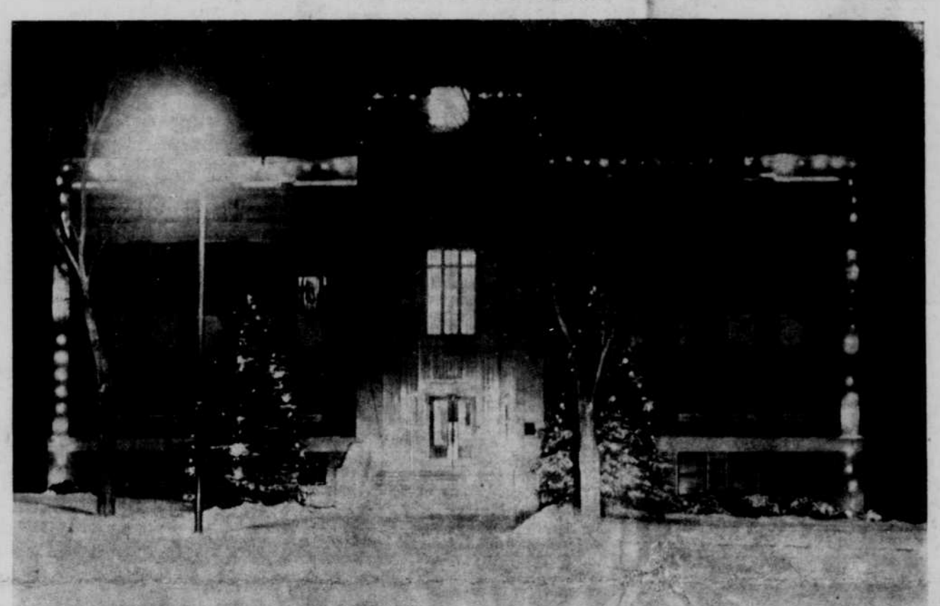
MERRY CHRISTMAS from the courthouse gang. (see story below)

next to sports—eating steaks. They will be guests of the Lettermen club at a steak dinner in the home economic room at school. The party is being given in recognition of their fine football season. Other school personnel will also be guests at the dinner.