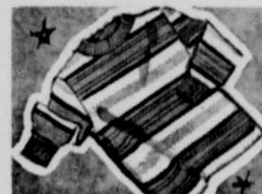
Nylon Tricot Slips Tot's Gay Polos

with fancy cuffs, novelty stitching to 1.29 Girls', women's.