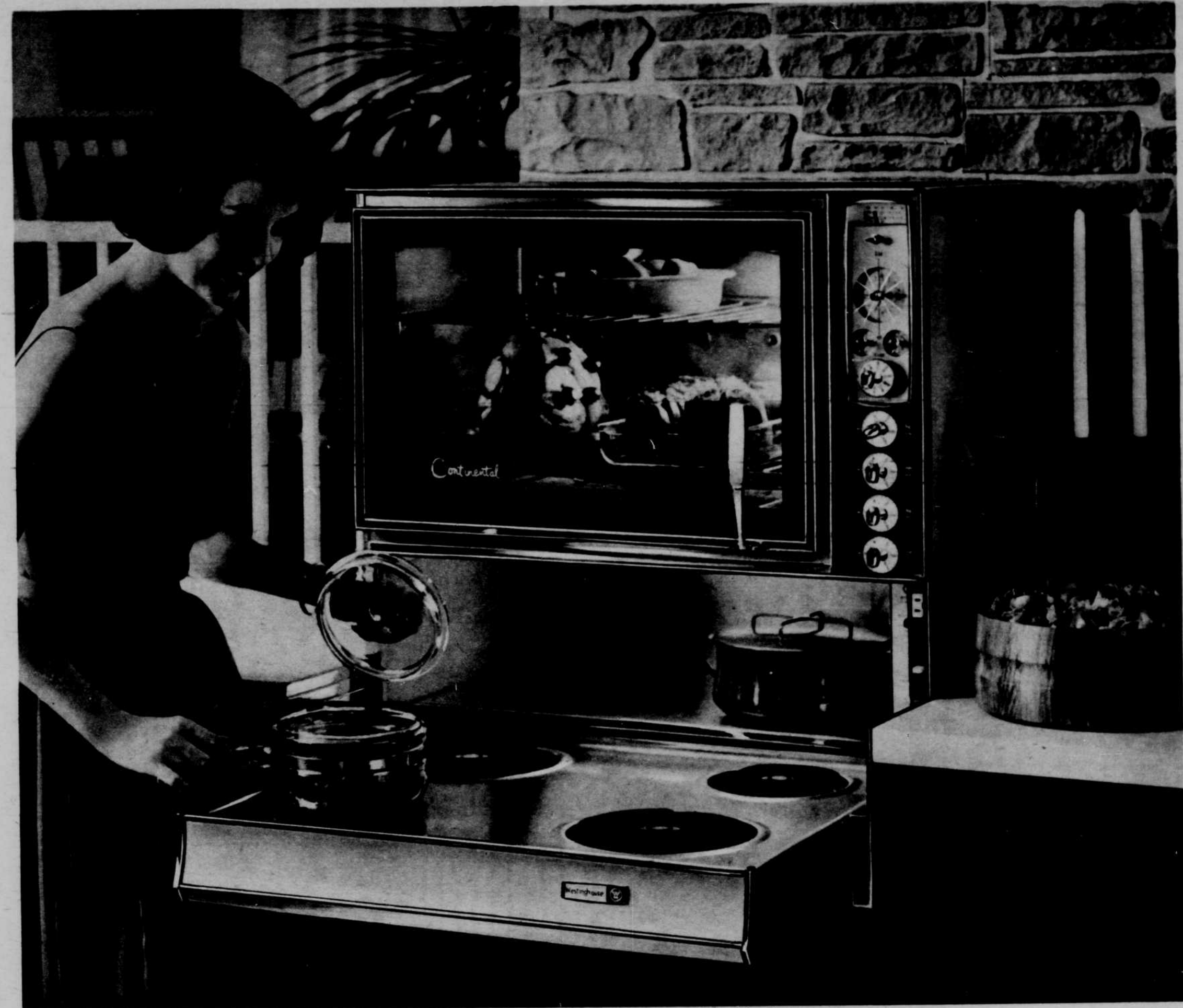
Continental Electric Range, Heirloom Maple Finish Cabinets, Micarta® Counter Top . . . all by Westinghouse.