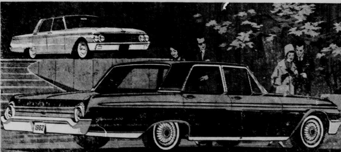
For '62 the Galaxie/500 offers all the elegant extras; the new lower-priced Galaxie is the easiest to own of luxury cars.

maintenance... cars of enduring elegance, with power to please... and 13 wonderful new Falcons, America's widest compact choice! Do come in and enjoy the most beautifully built Fords ever.