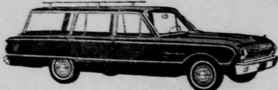
Falcon Squire...world's most luxurious compact wagon. Elegantly finished outside in woodlike side trim.

'62 Fords See the Features of the Future now at your Ford Dealer's