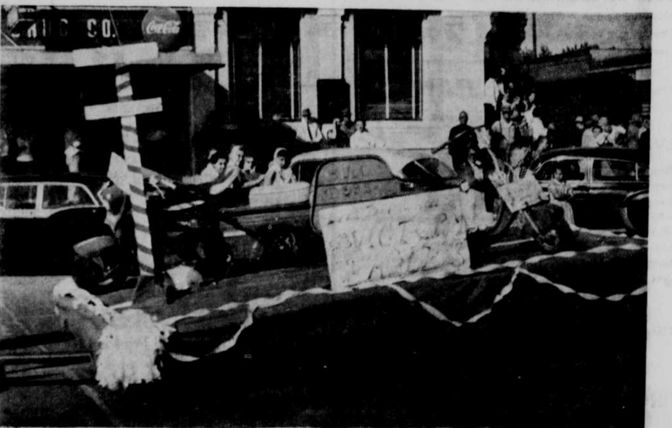
This float depicting the pitiful condition of the Bulldogs was prepared by the sophomore class.