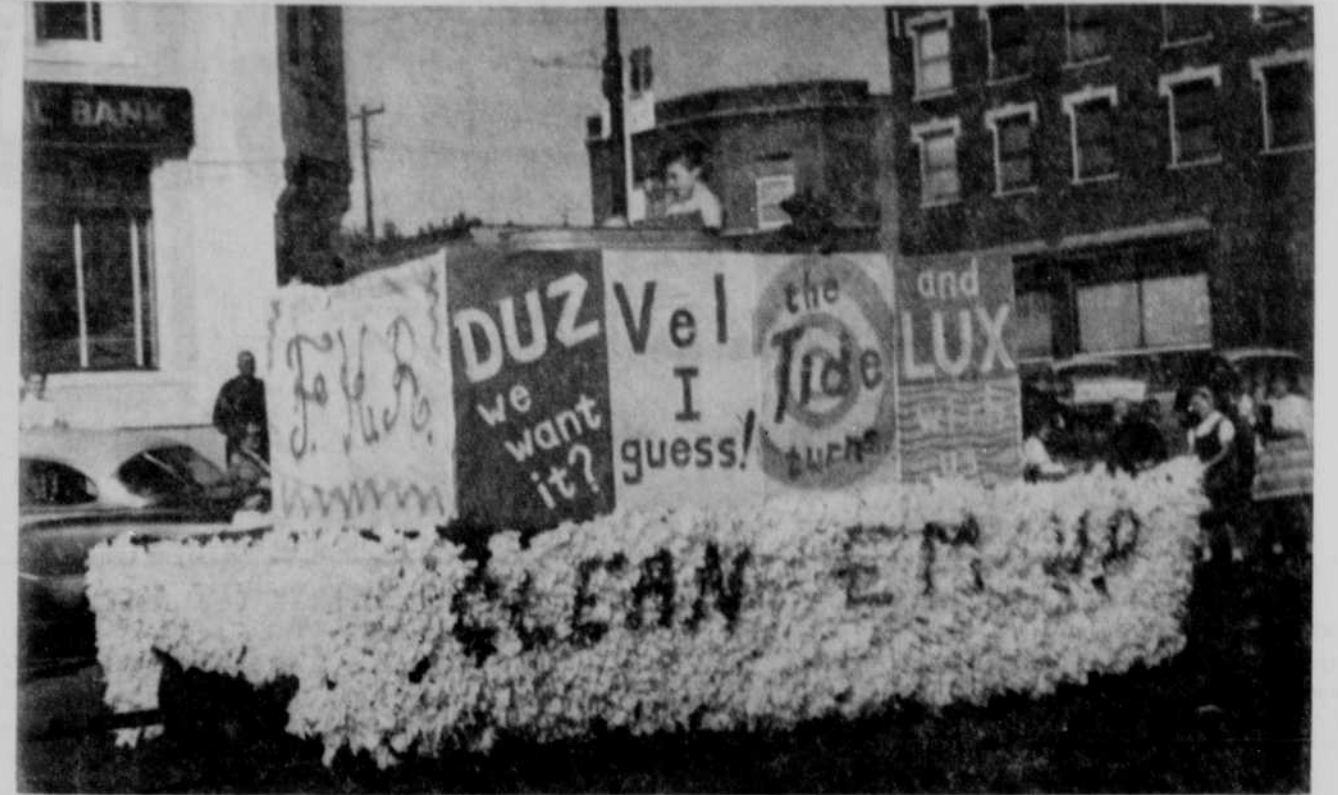
The Future Homemakers were going to give Creighton a good cleaning.