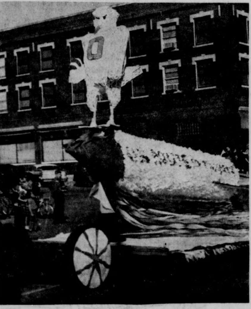
The Junior class took second place with their float showing an Eagle ready to blast off to victory.