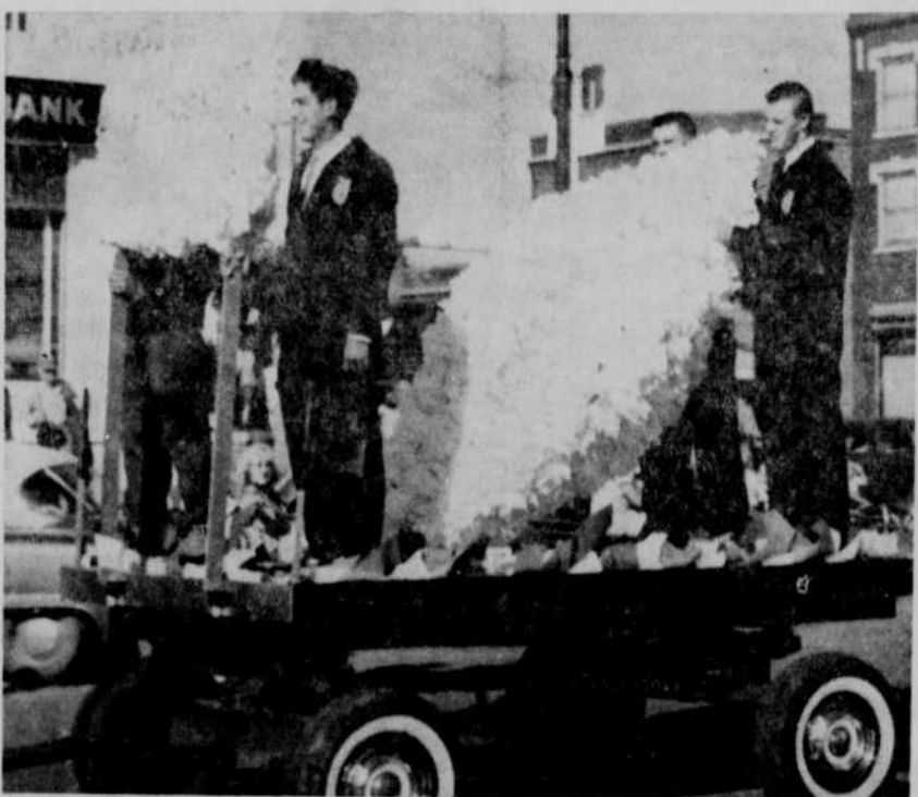
The Future Farmers float was all set to score.