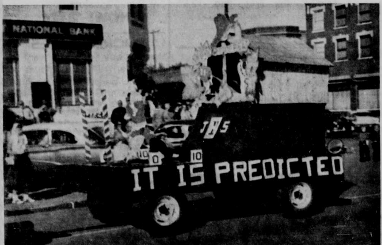
This float, entered by the Junior high, was named as the third place winner.