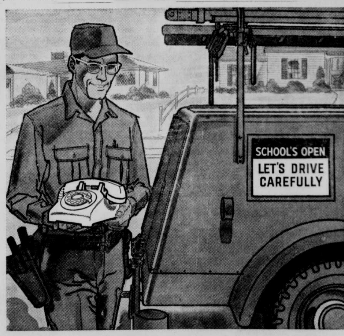
Delivering the most in step-saving convenience...