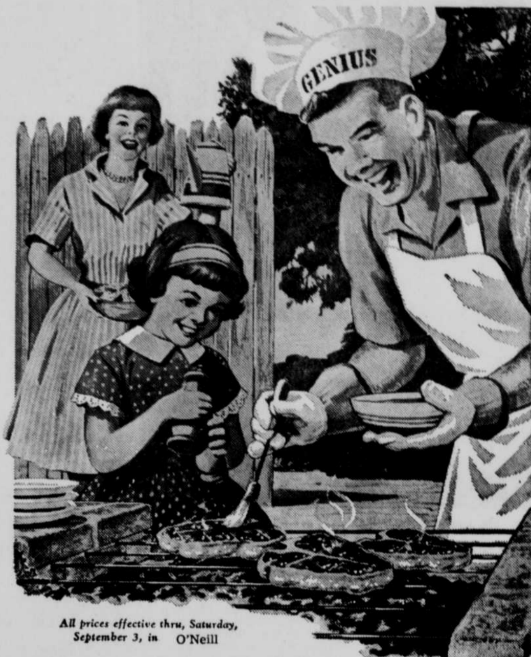
All prices effective thru, Saturday, September 3, in O'Neill

Last Big Holiday of the year! Gather the family and enjoy the last big "fling" in the great outdoors. Make Safeway your headquarters for all your holiday needs. Also, don't forget extra Bread, Milk, Butter and Eggs for the longer week-end ahead!