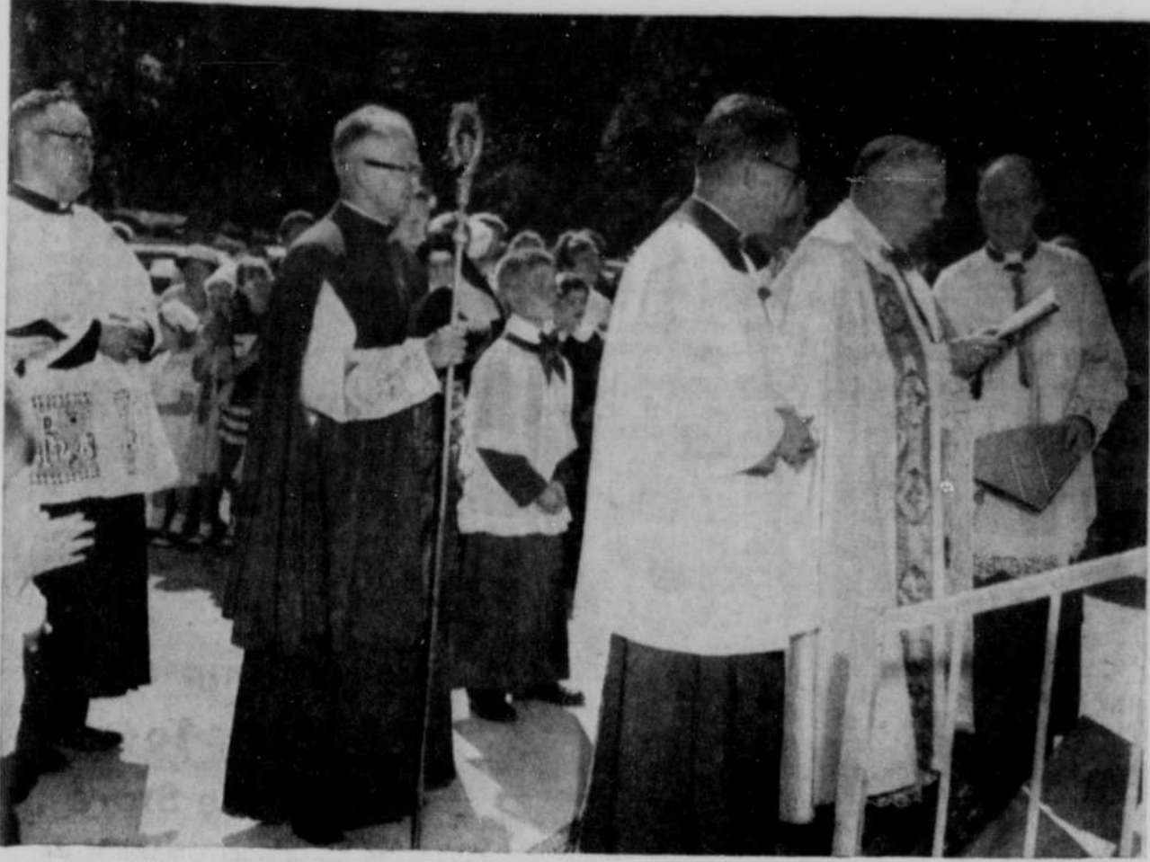
A capacity crowd was on hand to witness the ceremonies for the $50,000 church structure.