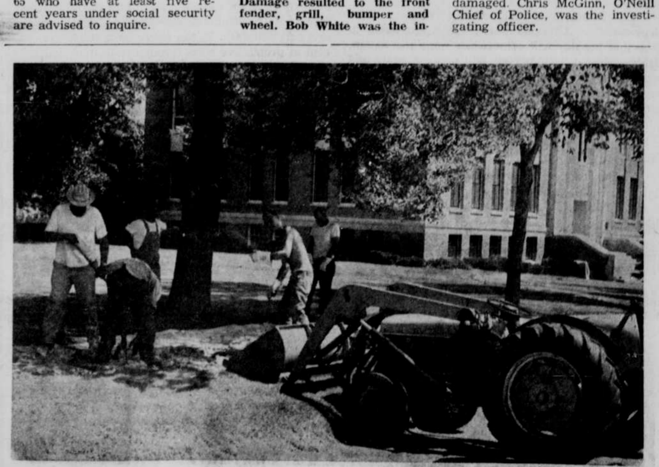
Workmen began the task Wednesday of replacing the sidewalk in front of the courthouse and the walk to the front entrance. This was one of the projects approved by the Board of Supervisors at their meeting Friday and Monday.