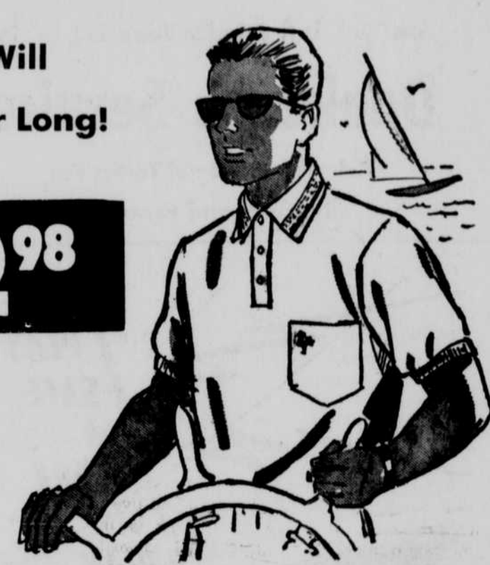
"Easy Action" Knit Shirt

The "Coronation" shirt by Palm Springs™ is fully washable rayon challis. New bone bronze and bone olive colors and pastels. "Easy Action" shirt is a knit slip-over by Garan. Knit insert in sleeves.