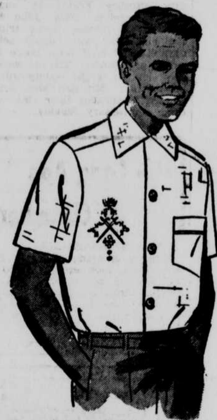
"Coronation" Sport Shirt

You'll want to give Dad a whole supply of these dress shirts! Made of fine Springs Mills cotton broadcloth, they need little or no ironing. White, pastel blue, grey, and tan. White shirts with soft or fused collar styles; pastels have soft collars. Sizes 14 1/2 to 17.