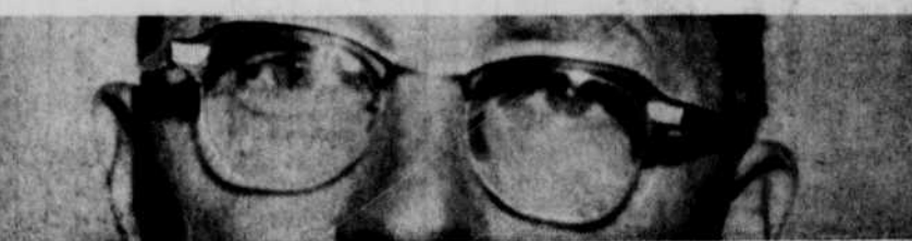
Nearly every Holt countyman has done business with this man. (Answer Next Week)

"Know Your Neighbor" is not a contest. There are no prizes given for correctly identifying the person pictured. The only reward is the satisfaction of "knowing" your neighbor.