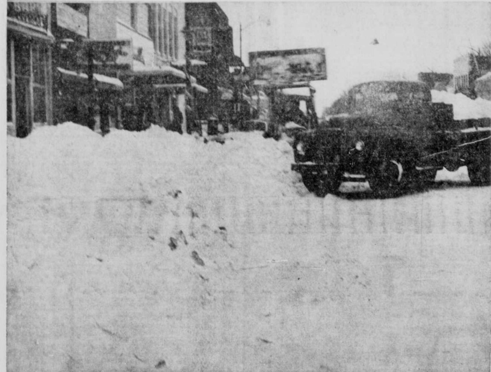
O'Neill Street crews work overtime to remove the four or more inches of snow which fell over the weekend. The crews were still busy Wednesday night hauling the slippery stuff off the streets.