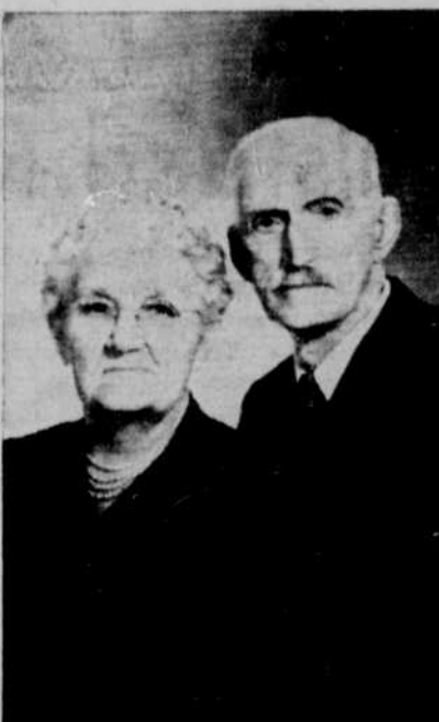
HAYNES COUPLE ... 60th wedding day