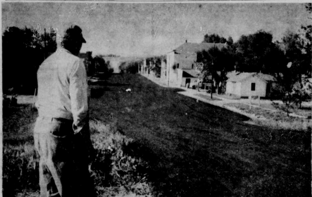
Citizens of Lynch view with satisfaction the paving of four blocks of downtown paving. Oral Pickering is among them as he looks north on main street from the railroad tracks at the edge of town.